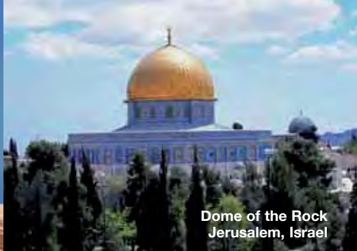
Dome of the Rock Jerusalem, Israel