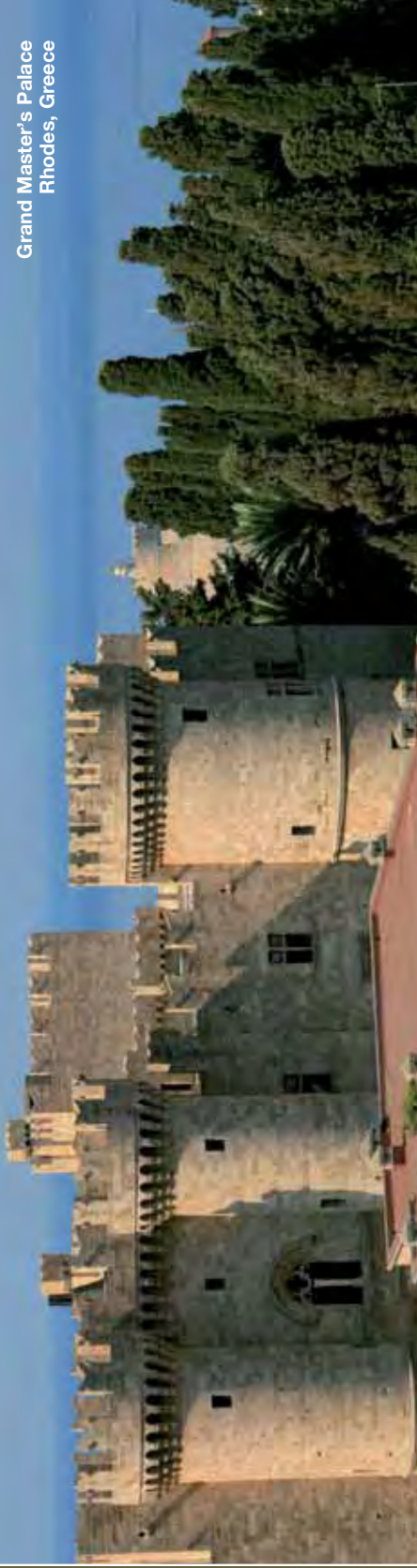
Grand Master's Palace Rhodes, Greece