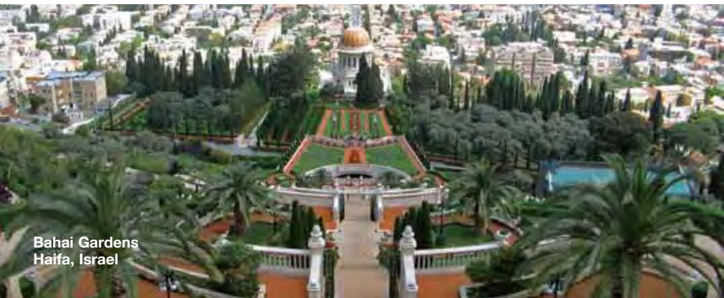
Bahai Gardens Haifa, Israel