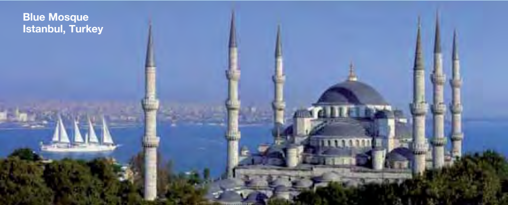
Blue Mosque Istanbul, Turkey

The agreement in this brochure is the exclusive and entire statement of the agreement between you and Go Next, Inc. It should be read carefully.