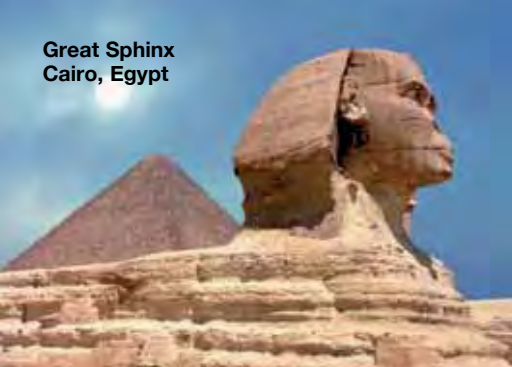
Great Sphinx Cairo, Egypt